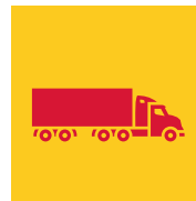
UK ROAD TRANSIT