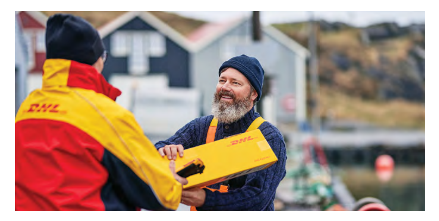
The DHL Optional Services listings are available at mydhl.express.dhl/us/en/ship/optional-services.html and will be updated or supplemented from time to time. Optional Services will be billed in accordance with the DHL list of Optional Services, Surcharges & Customs Services in effect at the time the shipment is tendered. DHL Optional Services, Surcharges & Customs Services & Customs Services are in addition to applicable transportation charges.

Upon the shipper's request, as indicated on the waybill, DHL will provide value protection coverage. Charges will vary based on origin of shipment and total of coverage requested (minimum charges apply). Shipper requests for Shipment Value Protection over $500,000 per shipment must be pre-approved by DHL. DHL is willing to consider these requests, but is under no obligation to approve them.