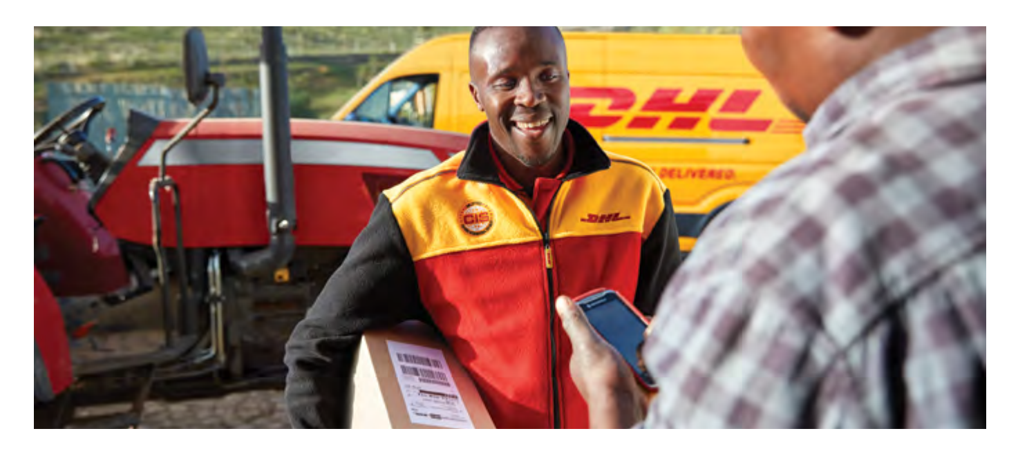
The DHL Surcharges listings are available at mydhl.express.dhl/us/en/ship/surcharges.html and will be updated or supplemented from time to time. Surcharges will be billed in accordance with the DHL list of Optional Services, Surcharges & Customs Services in effect at the time the shipment is tendered. DHL Optional Services, Surcharges & Customs Services are in addition to applicable transportation charges.

One or more Demand Surcharges will apply to shipments during a period of high demand. A period of high demand is to be determined by DHL at its own discretion, but may include a time of high demand for shipping services or a period with high operational cost. Details regarding the application of Demand Surcharges are set forth at <u>http://mydhl.express.dhl/</u> and will be subject to change upon prior notice. Demand Surcharges apply cumulatively if a shipment and/or individual pieces meet more than one of the specified criteria. Demand Surcharges apply in addition to the rates and any other applicable charges.